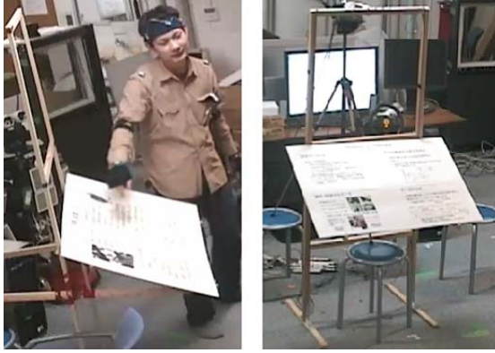
Figure 1: Outlook of poster board

record audio, video, human motion, and eye movements. We used a wireless head-worn microphone (Shure WH-30 XLR) in order to record every participant’s voice separately while enabling him to move freely in the room. In addition, we installed an array of eight omni-directional microphones (SONY ECM-77B). They were mounted on the top frame of the poster stand shown in Figure 1.